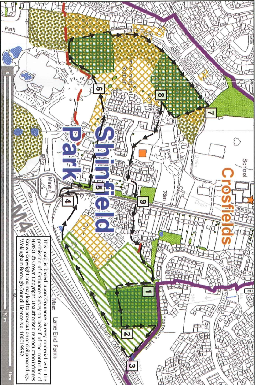
This map is based upon Ordnance Survey material with the permission of Ordnance Survey on behalf of the controller of HMSO. © Crown Copyright. Unauthorised reproduction infringes Crown Copyright and may lead to prosecution or civil proceedings. Wokingham Borough Council Licence No. 100019592

round and uphill to the gate onto Shinfield Road (A327). The bank by Lower Earley Way was constructed to help screen the road. The ditch on the opposite side of the path is a historical wood bank, with veteran field maple trees. The area at the top of the path was established in 2005, when the Black Boy roundabout was constructed. There is a wildlife pond and many native trees have been planted. The trunks of large trees that had to be felled were retained and later